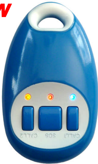
SMART-TRACK GPS LOCATION PENDANT (Actual size)