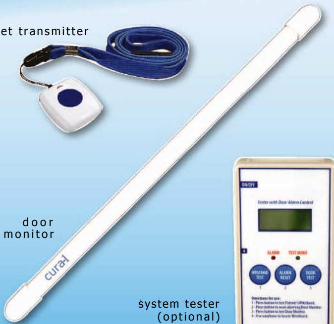
system tester (optional)