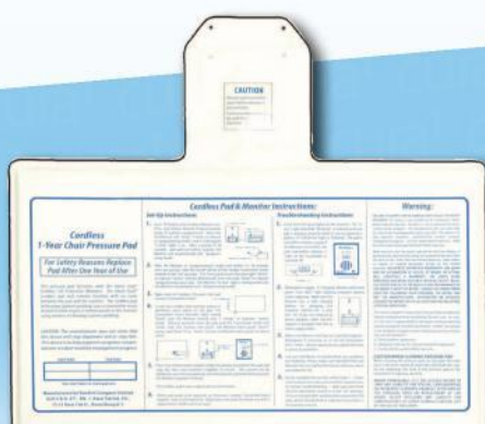
cordless chair pad