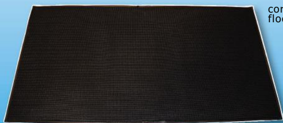
cordless floor mat