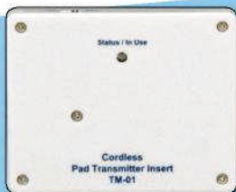
cordless pad transmitter insert