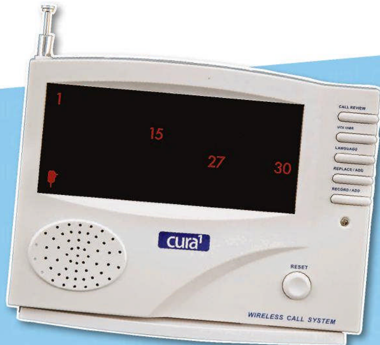
30 channel display panel