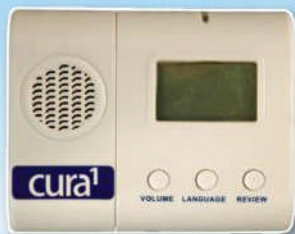
pager with numeric display